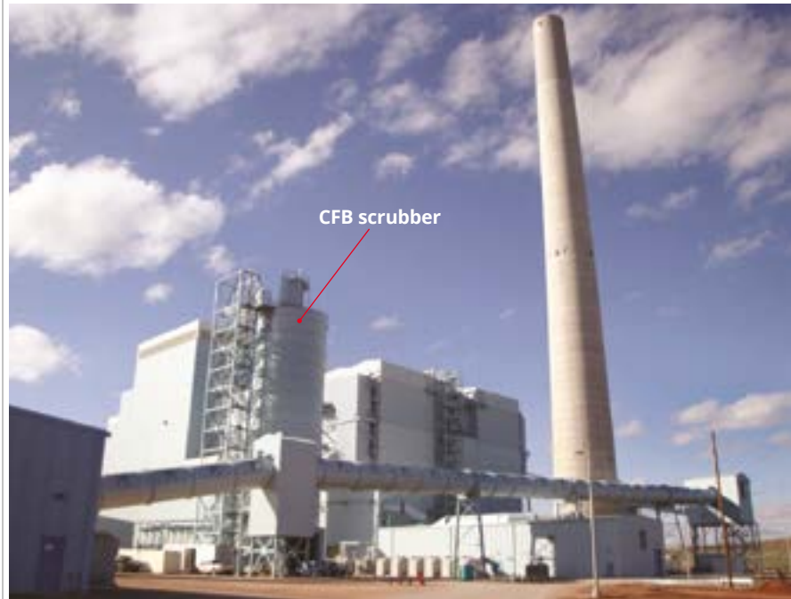
Right and below: Basin Electric Dry Fork Unit 1, with a plant electrical output of 420 MWe (or 520 MWe at sea level). The CFB scrubber at this plant, commissioned by SFW, is the largest in the world

For the Indian power market, 2022 is coming quickly and purchase decisions must be made very soon. Given these important characteristics, the CFB scrubber enjoys distinct and quantifiable advantages over competing flue gas desulphurisation processes. ■